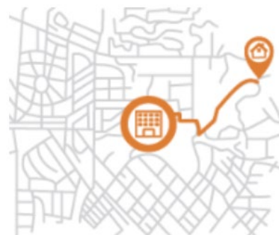
Home-Based VMT per employee (HBW)