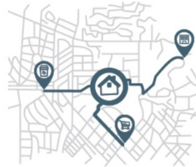
Home-Based VMT per resident (HBX)